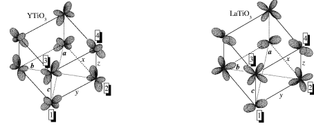
FIG. 1: t_{2g} -electron densities obtained in Hartree-Fock calculations after including the spin-orbit interaction. x , y , and z are the cubic axes. a , b , and c are the orthorhombic axes.

This result, however, prompts several new questions. (i) The magnetic coupling is expected to be AFM for all reasonable values of J=U . Therefore, this would explain the experimental situation in LTO, but not in YTO. (ii) It is not clear whether this O-O is compatible with the actual experimental distortion observed in LTO. Note that in the D_{2h}^{16} group, only inversion centers coincide with the Ti sites. Therefore, the local t_{2g} -level splitting is controlled by 5 independent parameters, which may include both trigonal and Jahn-Teller modes. All distortions are formally equivalent, at least from the viewpoint of D_{2h}^{16} symmetry, and a priori there is no reason why the particular trigonal mode should dominate. In addition to the t_{2g} -level splitting, the crystal distortion may also affect the transfer interactions through the buckling of the Ti-O-Ti bonds. 14 (iii) What are the roles of the K&K mechanism and the SO interaction? Are they totally quenched by the lattice distortion, as it was suggested