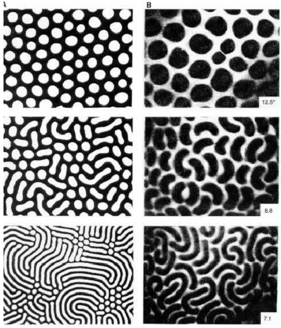
FIG. 1: Reproduced with permission from Science, Ref.[9]. Reversible “strip out” instability in magnetic and organic thin films. Period ( L_D ) reduction under the constraint of fixed overall composition and fixed number of domains leads to elongation of bubbles. Left panel (A) in magnetic garnet films, this is achieved by raising the temperature [labeled in (B) in degrees Celsius] along the symmetry axis, H = 0 (period in bottom panel, 10 \text{ m} ) (see Fig. 5). Right panel (B) In Langmuir films composed of phospholipid dimyristolphosphatidic acid (DMPA) and cholesterol (98:2 molar ratio, pH 11), this is achieved by lowering the temperature at constant average molecular density [period in bottom panel, 20 \text{ m} ].