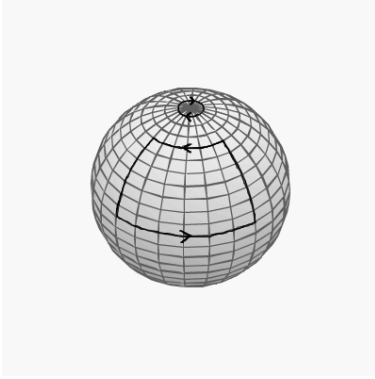
FIG. 2. The integration path on the sphere. The path shown at the center encircles a few vertices. The "total" path of the integration, encircling all twelve pentagons, includes two contours around the poles: negatively directed for the north pole (shown) and positively directed for the south pole (not shown).

Notice that for fullerenes with the full icosahedral symmetry (Ih) the combined flux turns out to be a sum of fluxes due to any pair of defects. Thus, the combined flux does not depend upon the arrangement of pentagons because any corresponding fragment of the lattice turns out to be of the above-mentioned class (1;1). In other words, in icosahedral fullerenes (n - m) \pmod{3} = 0 due to the mirror symmetry of the lattice. Finally, the continuous fields take the form