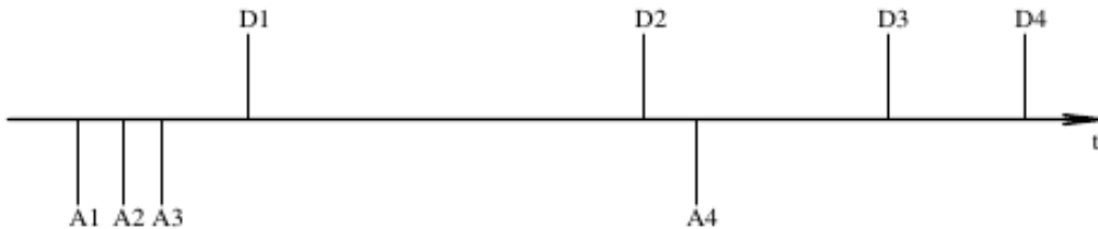
Figure 1: An example of a local flight schedule.

Thus, whatever the mapping, the energy E is restricted to the interval [0, N] , and between different pairings it can only change by an integer amount. Pairings yielding the lowest possible energy E_0 are said to belong to the ground-state, while a pairing with E = E_0 + k , k > 0 is said to belong to k :th excited state. In figure 1, an example of a flight schedule is depicted.