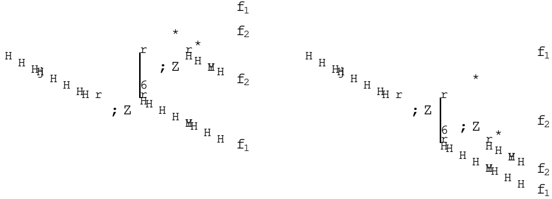
Fig. 2: The f_1 -deer diagrams. The f_2 -deers may be obtained by interchanging f_1 and f_2 .

between f_1 -deers and f_2 -deers, between crabs and f_2 -deers, and between crabs and f_1 -deers, respectively.