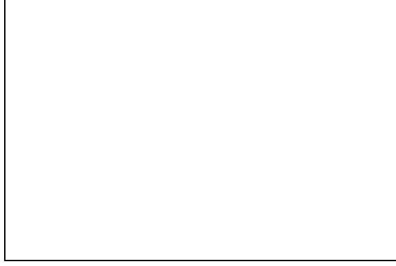
Figure I: \gamma \in \Gamma_P(T)

d) We shall say a diagram has a k -loop if there exist a sequence of k edges