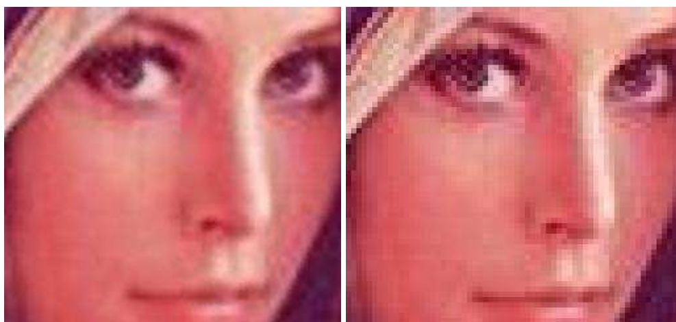
FIG. 2: Enlargement of the area around the face of Fig. 1 via a) a fractal interpolation function b) a linear interpolation