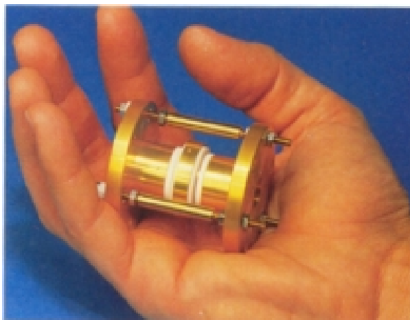
Figure 3: Small antimatter trap. (Dan Brown, Angels and Demons, Atria Books, 2005, ISBN 0-7432-7506-3, p. 71.)

collisions of protons turning in opposite directions [29]. In theory, an even higher yield could be obtained if conditions similar to the original “Big Bang” could be recreated in the laboratory, conditions in which proton-antiproton production becomes spontaneous, a possibility that was first discussed by Edward Teller et al. [30]. Such conditions might be found in quark-gluon plasmas, which could be produced in high-energy heavy-ion collisions, which are presently the subject of intense research [31].