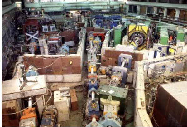
Figure 1: Overview of the LEAR experimental area. The Low Energy Antiproton Ring (LEAR) at CERN, is the only one of its kind in the world. It enables scientists to study the details of antiproton interactions with the nucleus of atoms. In the picture we can see the 80 meter in circumference ring that permits the storage and slowing of antiprotons down to energies as low as 5 MeV. It's the first machine ever built to decelerate, rather than accelerate, particles.

one microgram of antihydrogen. The result would be a bomb so-called “clean” by the militaries, i.e., a weapon practically free of radioactive fallout, because of the absence of fissile materials (Fig.2).