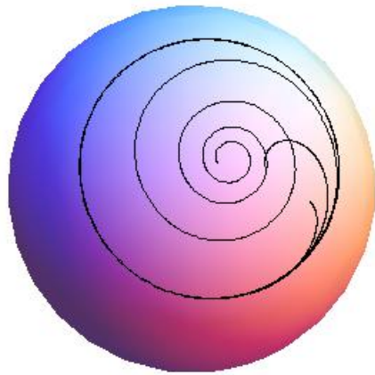
Figure 3: Curves of constant torsion approaching a circle