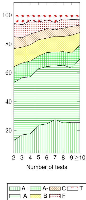
Figure 2: Grade Distribution compared to the number of checks done with Qualys SSL Test