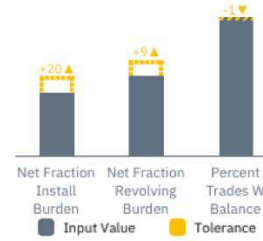
(a) Positive counterfactual explanation