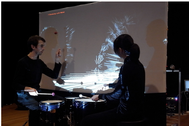
Figure 3: One interactive scene in the performance.

(‘c’) placed around 3 meters in front of the performers to see a clean silhouette of the performers and instruments. A projector (‘p’), outputting mainly visible light is also placed in front of the screen to project onto both the screen and performers. Additionally, a microphone (‘m’) is placed underneath the instruments and loudspeakers are hidden with all computer equipment behind the screen and IR lights.