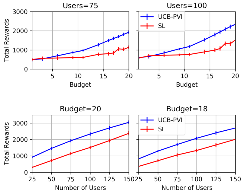
Figure 2: Comparison of UCB-PVI-HF and SL

generalize to noisy thresholds, user-dependent initial budgets and patience depletion costs, and to mixed feedback models.