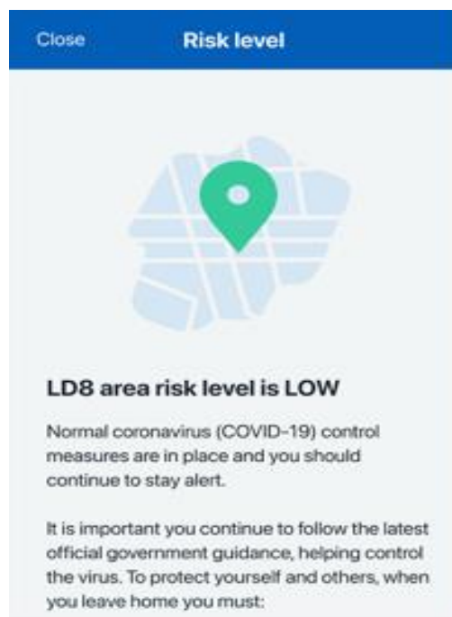
Fig. 1(b). Risk alert map

explanation is present, but it is either limited or so obscure that it can not be considered to be of much use. The negative effectiveness rating is a consequence of poor download rates (to date) of both versions, which limits their effectiveness in Covid-19 infection tracing. As may be expected, security/privacy values have the most salient impact, followed by helpfulness for the individual and society, also expressed as the altruism motivation. Secure data encryption has been emphasized in both versions as a positive contribution to counter privacy fears. The centralized design has more negative security/privacy implications than the decentralized design; however, this may be balanced by benefits of more targeted risk analysis and better integration with scientific advice supported by centralized data. Privacy fears in the centralized version may spill over into a negative assessment of freedom/autonomy from ‘big brother’ state control.