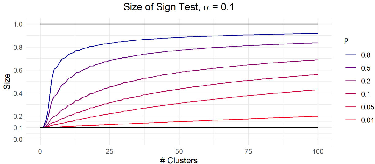
Figure 2: Size of the 10%-level permutation test with the equicorrelated model under various values of \rho . Over-rejection rate test increases monotonically in the number of sub-clusters and in \rho , the amount of correlation within each cluster. Power is evaluated using Gauss-Hermite quadratures with 1000 nodes.

Assumption 3. Let Y \sim N(\mu, \Sigma) , where