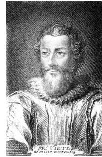
François Viète

François Viète (1540–1603) was French and published under the Latin version of his name, Franciscus Vieta. In the 1591 “Introduction to the analytic arts” he used capital vowels for unknowns and capital consonants for constants. “If this seems reminiscent in principle of our modern notation of x, y , and z for unknowns and a, b, c , etc. for indeterminate magnitudes, a convention which we owe to René Descartes in the seventeenth century . . . , it is important to recognize that Viète’s symbols or ‘species,’ unlike ours, carried explicit geometrical meaning. They had dimension, and only expressions of the same dimension were commensurate” [12, p. 316]. ◁