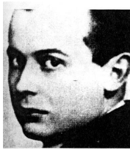
John von Neumann

In the talk underlying this paper I spoke about Hermann Weyl and John von Neumann, mostly because I encountered them twice, first in foundations of mathematics and computing, and then, many years later, in foundations of quantum theory.