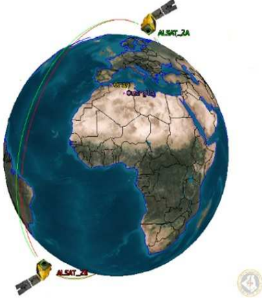
Fig. 1. Orbits of Alsat-2B and Alsat-2A.