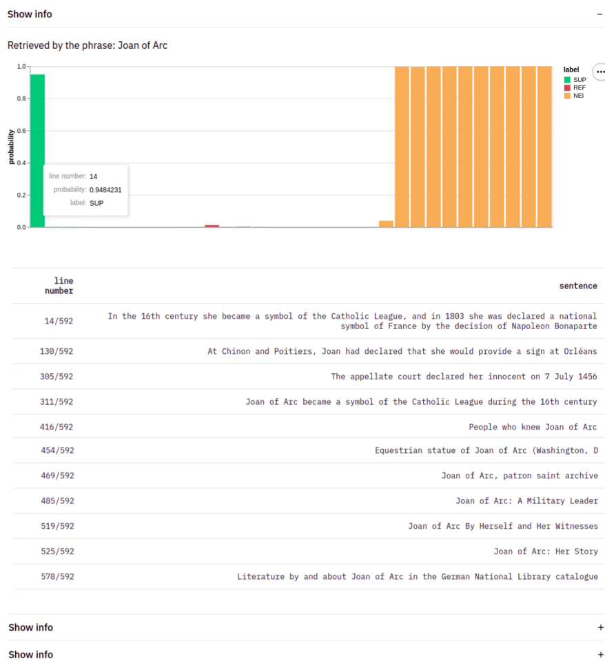
Figure 4: Screenshot showing details about “Joan of Arc”, a Wikipedia article retrieved when verifying the claim “Napoleon Bonaparte declared Joan of Arc a national symbol.”