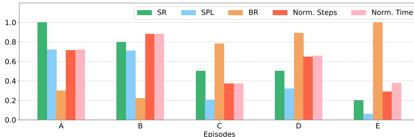
Fig. 3. Comparison of the main navigation metrics on different episodes.

some time to general exploration of the surroundings. Finally, we find out that the most challenging scenario for our LoCoNav is when reaching the goal requires to get out of a room and then enter a door immediately after, on the same side of the corridor (as in E). Since the robot sticks to the shortest path, the low parallax prevents it from identifying the second door correctly. Even in these cases, a bit of general exploration helps to solve the problem.