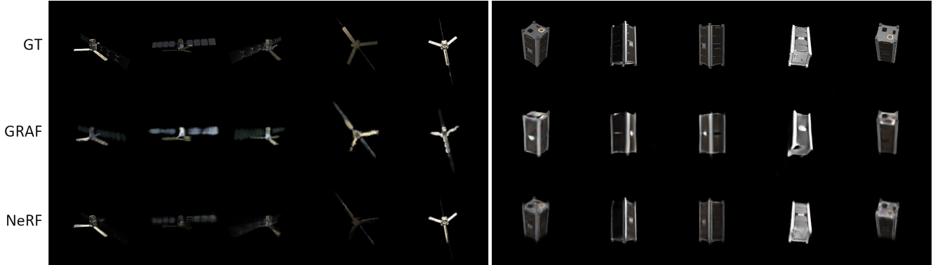
Figure 1: A Neural Radiance Field (NeRF) [31] and a Generative Radiance Field (GRAF) [40] are trained with synthetic datasets of SMOS and CubeSat satellites (resp.), at image resolution 256 \times 256 pixels. GT: ground truth. We generate images of the satellites from previously unseen viewpoints. Although it is trained with unposed images, GRAF allows for explicit camera control. NeRF generates more accurate images than GRAF regarding the lighting conditions, the view dependent effects and the pose of the object. Both learn surface specularities.

Unlike most previous stereo-photogrammetry approaches, NeRF models are able to account for view-dependent effects such as surface specularities. More recently, a generative model for radiance fields has performed successful 3D-aware image synthesis and 3D shape estimation of objects from unposed images. Generative Radiance Fields (GRAF) [40] offer explicit control on the camera pose, allowing to generate images of the object from unseen viewpoints. They also have the ability to disentangle the shape of the object from its appearance when considering several similar objects. To address the scarce availability of good enough images of orbiting objects, synthetic dataset were produced to simulate the necessary orbital scenes and including two different satellites. On these, we compare the ability of NeRF and GRAF to generate images and recreate the accurate shape of the satellites from unseen viewpoints. Using information on the relative position and orientation of the camera, NeRF is able to identify a non-cooperative object, providing a 3D representation of its shape and color values. GRAF, on the other hand, opens a whole new perspective as it performs the same task using unposed images only, without prior knowledge of the viewing direction.