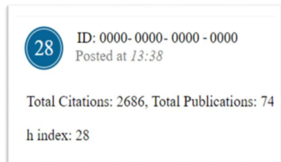
Fig. 3. Example of an author block.