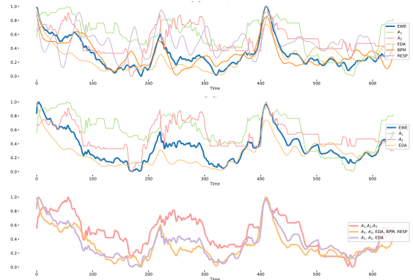
Figure 2: An example for subject #9 for three of the gold standards used in these experiments. (Upper) A_1, A_2 + EDA, BPM and RESP ( \pm: 0.203 ). (Middle) A_1, A_2 + EDA ( \pm: 0.217 ). (Lower) comparison of the above gold standards including arousal only ( \pm: 0.241 ).

Alignment: The label-aligned features are made available from the MuSe challenge. These include the same frame rate as the