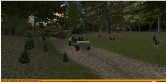
Figure 2: An AGV evolving in an environment created by the 4d Virtualiz simulator.

When a graph is defined, the simulator links it to the 3D map and several built-in functionalities become available. We can thus generate custom missions for the AGV by defining a start position, an end position, and a list of mandatory waypoints. Additional environment parameters are available in such simulators and we consider a few representative ones in this work. In particular, we experiment with the rain variable x_1 , the fog variable x_2 and the wind variable x_3 . When sending the AGV on a defined mission I = (s, d, M) taking a path P , the simulating system will make the vehicle drive on a set of edges e \in P . Edges resulting in autonomous failure (vehicle getting stuck or taking longer than a set timeout threshold) Q \subset P correspond to difficult sections of the path, which would require manual control of the vehicle. The criteria for autonomous feasibility depends on both current weather conditions and terrain structure and topology, as well as the vehicle’s autonomous capabilities.