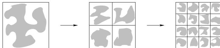
Figure 1. First two steps of a cellular flow

Cellular structure. The rough idea of the cellular structure is sketched in Figure 1. We start with a binary initial condition \rho_0 with zero average on the 2-dimensional square Q . In a first step we subdivide Q into 4 disjoint sub-squares D_1, \dots, D_4 of equal size. We then construct a velocity field u_0 in such a way that the solution \rho(1, \cdot) has zero average on each of the sub-squares, which means that the tracer gets equally distributed among D_1, \dots, D_4 , as schematically visualized in Figure 1. We