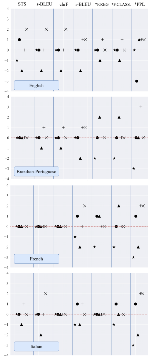
Figure 2: Difference in relative ranking between human judgments and automatic metrics across systems (i.e., represented by different markers) for different evaluation dimensions. STS, s-BLEU and chrF are compared with meaning rankings, r-BLEU (reference-BLEU) with overall, XLM-R classifiers (*F.CLASS) and regression (*F.REG) models with formality, and XLM-R pseudo-perplexity (*PPL) with fluency.

bilingual resources (i.e., OpenSubtitles) and learns to translate jointly between and across languages.