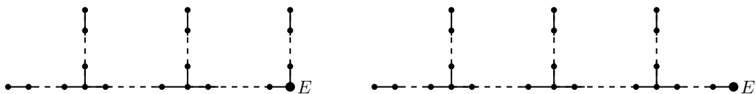
FIGURE 1. The shape of the dual graph in the case \ell_E = 0 on the left (resp. \ell_E > 0 on the right). The vertex corresponding to E is marked by a bigger bullet.

We introduce the notion of generating sequence of a finite set of divisorial valuations according to Delgado, Campillo, Galindo and Núñez (see [CG03, DGN08]), based upon the work of Spivakovsky who described the case of one valuation (see [Spi90]).