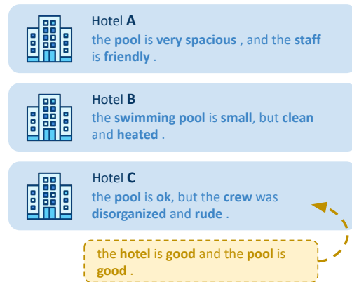
Figure 1: An illustration about the necessity of comparative explanations. The recommended Hotel A, B, C are listed in a descending order, with the provided explanations to justify the ranking. But if we replace Hotel C's explanation with the one in the dash box, users may no longer perceive the ranking of all three hotels.

the systems [47]. Previous research shows that explanations, which illustrate how the recommendations are generated [22, 30] or why the users should pay attention to the recommendations [33, 39, 46], can notably strengthen user engagement with the system and better assist them in making informed decisions [4, 15, 32].