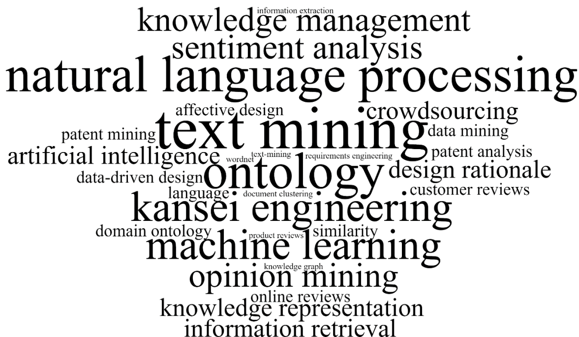
Figure 2: Top 30 keywords w.r.t., frequency.