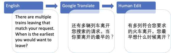
Figure 1: Three stages of our data collection: Data selection, machine translation and human correction.

To facilitate the development of multilingual task-oriented dialog systems, we create