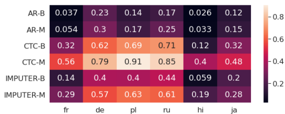
Figure 2: % Invalid words observed in the outputs from all languages. “-B” and “-M” and bilingual and multilingual models respectively.

subwords, which merge to create invalid words.