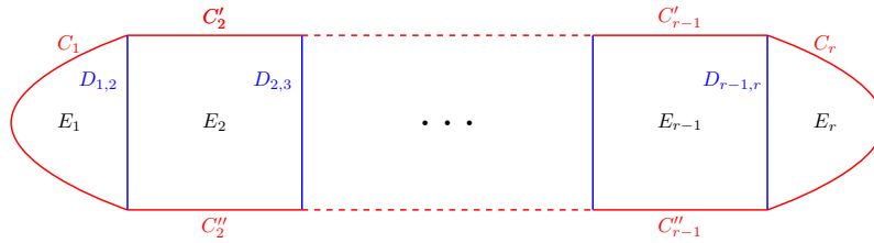
FIGURE 2. Exceptional divisor E of Type III_1

Note that (iv) implies that there exist points p'_i, p''_i in D_{i,i+1} for 1 \leq i \leq r-1 , which are smooth points on D , and such that T_E^1 \cong \mathcal{O}_D(-\sum_i (p'_i + p''_i)) .