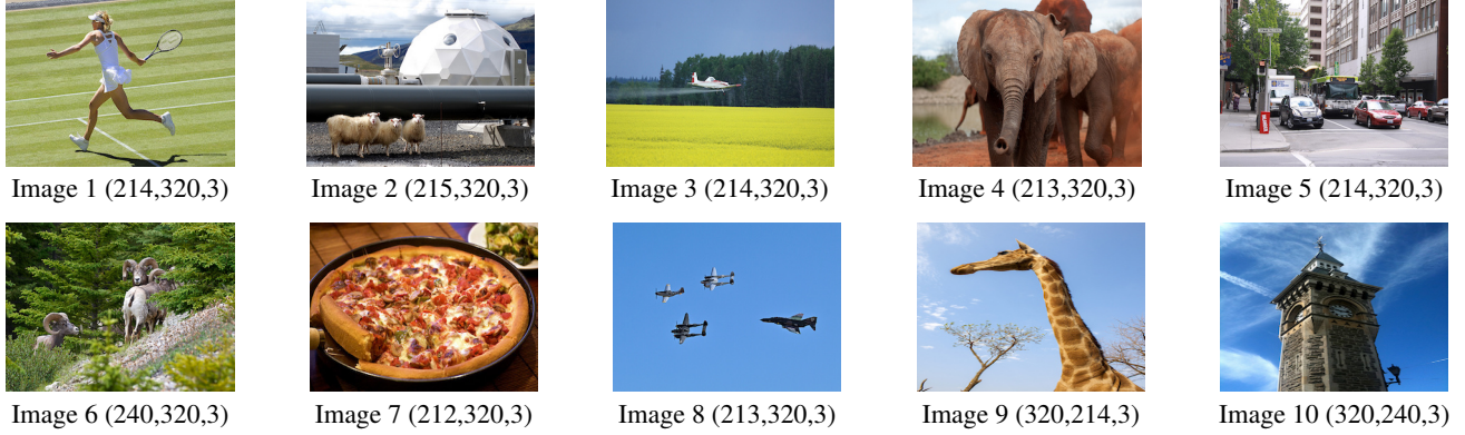
Fig. 1. The arbitrary selected images form COCO data set (the images are not depicted to their correct scale and the numbers written in parenthesis (height, width, depth) refers to the original shape, \theta , of the image’s data array).