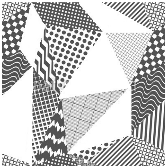
Figure 2: Ethical system - patchwork of norms

similar ethical settings. The extrapolation, if it may be simply and uniquely done in the first place, is not guaranteed good performance or relevance.