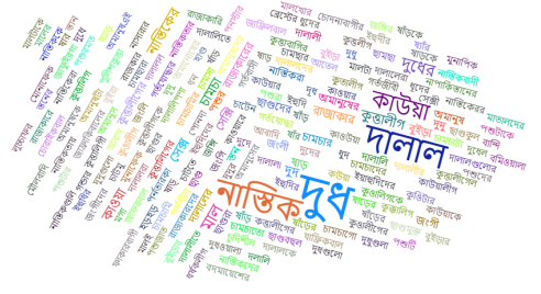
Figure 2: Non Traditional Swear Word Cloud