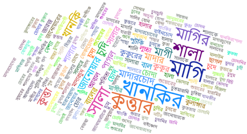
Figure 1: Traditional Swear Word Cloud