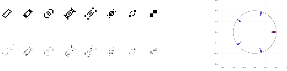
Figure 1: Left: Illustration of a period eight instance of LifeGame; (top) original transitions. (down) an instance of noised observation. Right: \mu -nearly periodic dynamics (5.1).