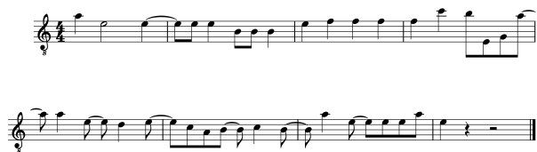
Figure 4: Melody generated for data points corresponding to 2004, with default priming seed and maximum extra notes length of 32.