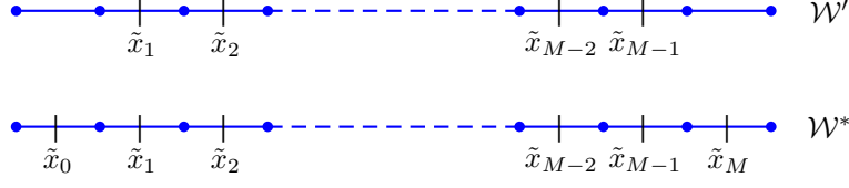
Figure 1: The sets \mathcal{W}' and \mathcal{W}^* .

The dual of a dual set will be denoted as \overline{\mathcal{W}} := (\mathcal{W}^*)^* and \overset{\circ}{\mathcal{W}} := (\mathcal{W}')' . We note that if \overline{\mathcal{W}} = \mathcal{W} , it follows that for two consecutive points x_i, x_{i+1} \in \mathcal{W} we have x_{i+1} - x_i = h . Thus, any subset \mathcal{W} \subset \mathcal{K} that verifies \overline{\mathcal{W}} = \mathcal{W} will be called regular mesh. We denote by C(\mathcal{W}) the set of function defined in \mathcal{W} \subset \mathcal{K} . Then, for u \in C(\mathcal{W}) the translation operators is given by \tau_{\pm}u(x) = u(x \pm h/2) . We note that \tau_{\pm} : C(\mathcal{W}) \rightarrow C(\mathcal{W}^*) . Moreover, for u \in C(\mathcal{W}^*) we have that \tau_{\pm}u \in C(\overline{\mathcal{W}}) . We define the average and the difference operator for u \in C(\mathcal{W}) as