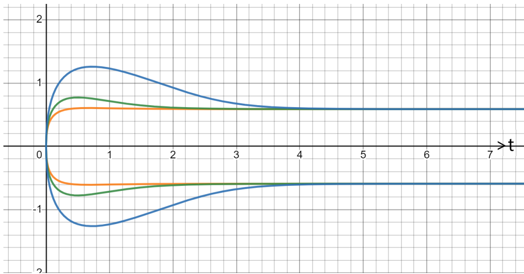
Figure 3: Transformed curves (29) for \beta = 0 , k = 1 , a = 1 and \alpha = -1 (orange), 0.5 (green), 0.1 (blue).