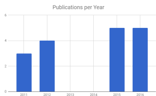
Figure 1: Number of publications per year, excluding 2017.