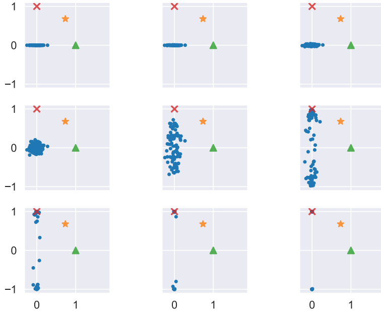
Figure 1: Regression setting, directional convergence. From left to right, top to bottom, we plot the directional information at timestamp t = 0, 5, 10, \dots, 40 , once every 5 iterations.

Directional convergence: regression Consider (1.9) with \mathbf{y}|\mathbf{x} = x \sim \text{Gaussian}(\langle x, \theta^* \rangle, 1) and \ell(y', y) = (y' - y)^2 . The adversarial distribution shift evolves according to (1.12). Here the blessing direction \Delta_b defined in (2.1) is precisely marked by Red × . As seen in Fig. 2.3, the Blue ● data clouds collapsed to a align perfectly to \Delta_b , rapidly. We emphasize that since the simulation is done in high dimensions, directional convergence |\langle \frac{x_t}{\|x_t\|}, \Delta_b \rangle| = 1 is only true when the Blue ● perfectly lands on \{\pm \Delta_b\} , shown in t = 40 (the bottom right subfigure); just aligning to a direction in the two-dimensional domain does not imply directional convergence in \mathbb{R}^{200} .