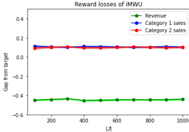
Figure 2 Performance of different \mathcal{J} sizes