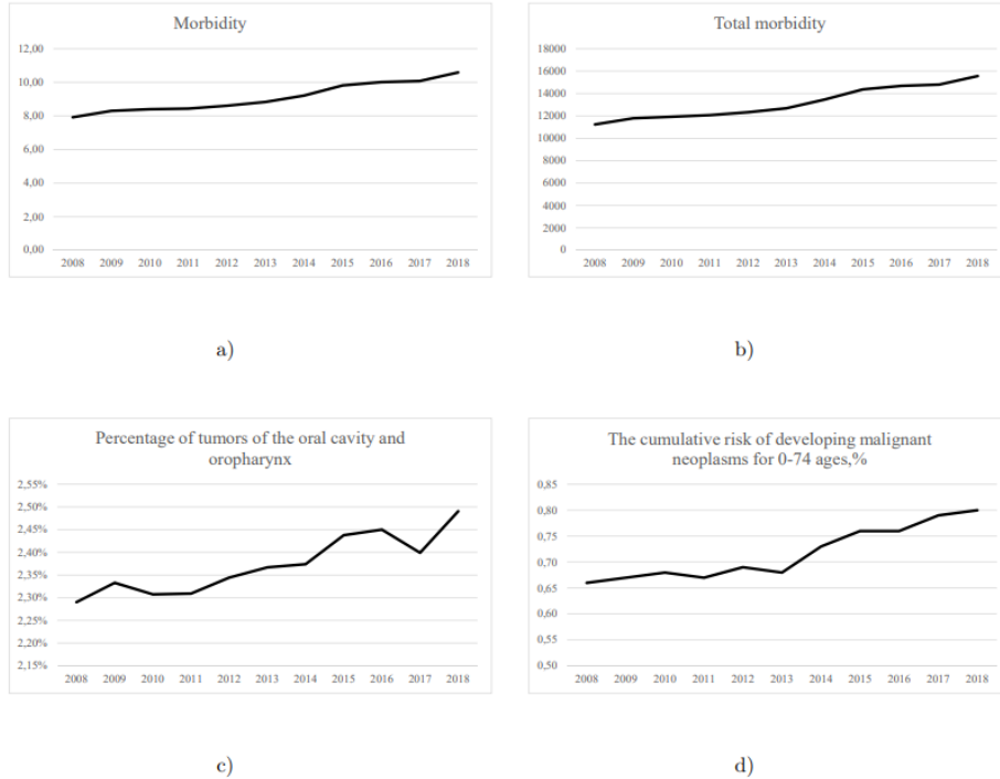
Fig. 1. The dynamics of the incidence of tumors of the oral cavity and oropharynx in 2008-2018 years [3, 4].

share of localization presented (Figure 1, c) and the cumulative risk of developing malignant neoplasms in the range of 0-74 ages (Figure 1, d) are growing.