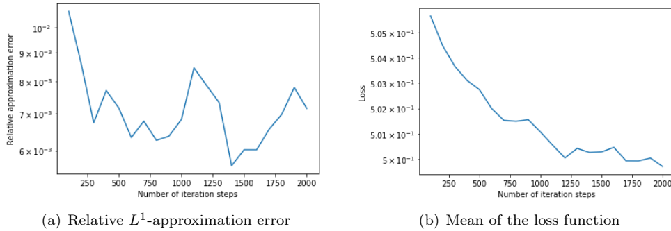
FIG. 7.2. Relative L^1 -approximation error of u(0, X_0) and mean of the loss function.

The relative L^1 -approximation error of u(0, X_0) and mean of the loss function are presented in Fig. 4.2 from which we observe that the relative L^1 -approximation error of u(0, X_0) oscillates when the number of iteration steps becomes larger. We also see that the mean of the loss function decays as the number of iteration steps increase.