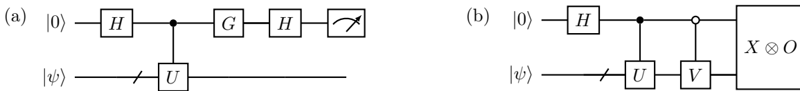
Figure 2: Circuits used in our algorithms. We sample strings of quantum gates, consisting of specified Pauli operators and Pauli rotations, and perform quantum circuit runs with controlled versions of these gates. (a) Hadamard test circuit, first used proposed for use in the early fault-tolerant regime by Lin and Tong [27]. Measuring the expectation value of Z on the first register returns \text{Re}(\langle\psi|U|\psi\rangle) and \text{Im}(\langle\psi|U|\psi\rangle) for choices of G = \mathbb{1} and G = S^\dagger := |0\rangle\langle 0| - i|1\rangle\langle 1| respectively. (b) Using the circuit considered in Ref. [33] to randomize multi-product formulas, one can apply controlled- U and anticcontrolled- V , followed by measurement of observable X \otimes O to return \frac{1}{2} (\langle\psi|U^\dagger O V|\psi\rangle + \langle\phi|V^\dagger O U|\psi\rangle) .

We provide the proof of Proposition 1 in Appendix A.1. A key technical tool we use is the random compiler lemma of Ref. [28] which decomposes fractional time evolution operators into a probabilistic mixture of Pauli matrices and Pauli rotations. This leads to a decomposition of the full time evolution operator simply by taking the product of such fractional operators. Namely, for some time parameter t \in \mathbb{R} , for any choice r \in \mathbb{N} and for Hermitian matrix A with known Pauli decomposition as in Eq. (1), Ref. [28] shows how one can obtain the decomposition